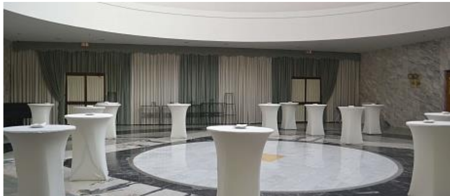
Winter garden hall